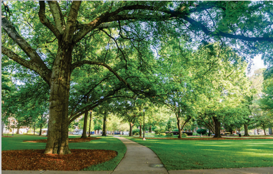
Spring has arrived on The University of Alabama campus.

SAFETY FIRST. INTEGRITY ALWAYS. SERVICE EXCELLENCE. TEAMWORK.